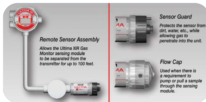
Ultima XIR Accessories

Offices and representatives worldwide For further information: